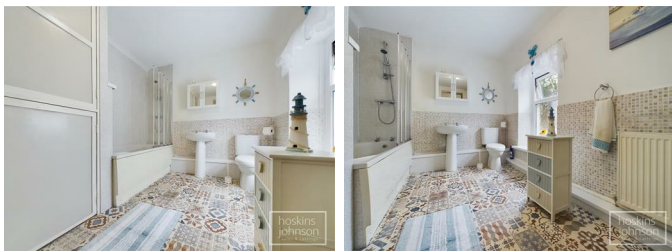
White three piece suite comprising panelled bath with mains shower and panelled walls, wc, wash hand basin, part tiled walls, wall mounted gas combination boiler, storage cupboard, double glazed window to side.