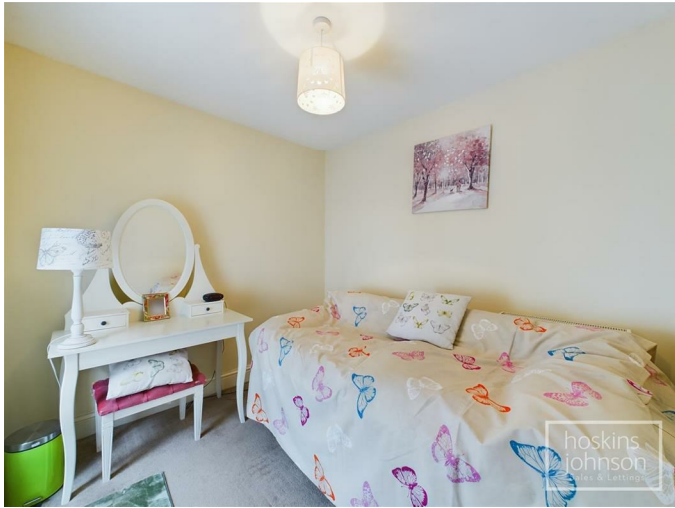
Bedroom 2 8'10" x 8'5" (2.70 x 2.59)