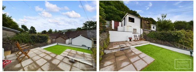
Paved forecourt. Terraced garden with paved seating area, artificial grass and garage/storage shed with lane access.