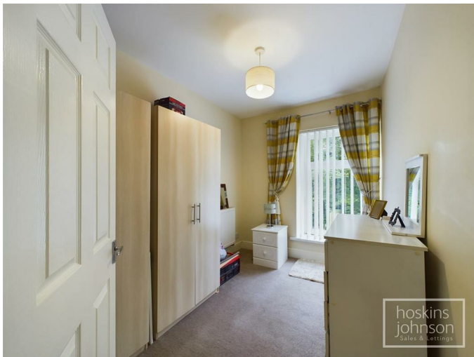
Double glazed window to front, radiator.